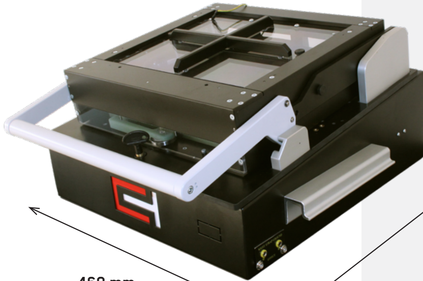
Equip ND-MFS-D3-PYL Mechanical Fixture

W 460 mm [18.110] with Alum-A-Grip Handles 549 mm [21.614]